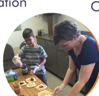
Service to others